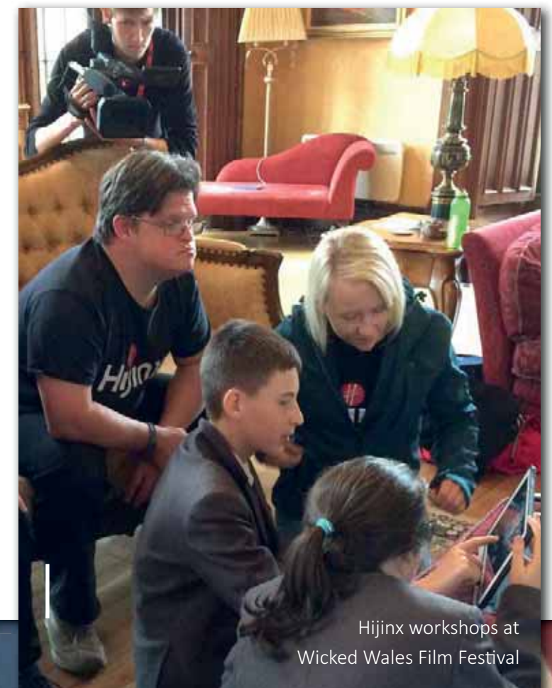
Hijinx workshops at Wicked Wales Film Festival