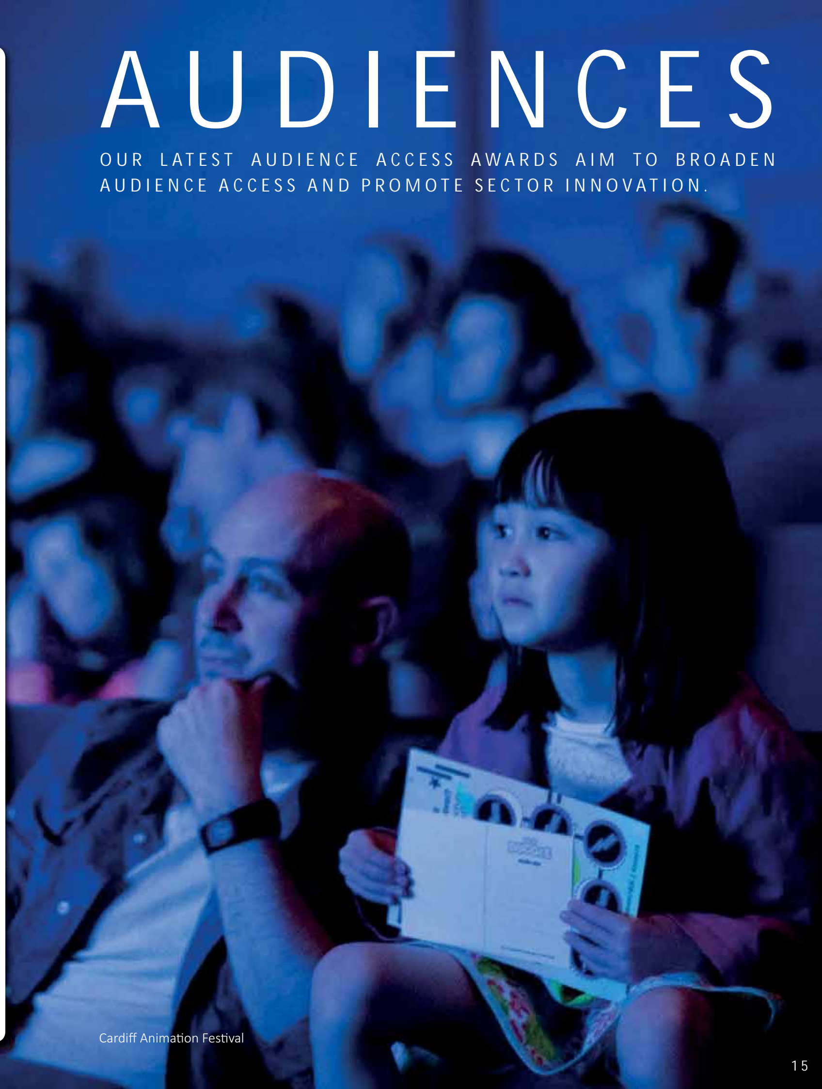
Cardiff Animation Festival

OUR LATEST AUDIENCE ACCESS AWARDS AIM TO BROADEN AUDIENCE ACCESS AND PROMOTE SECTOR INNOVATION.